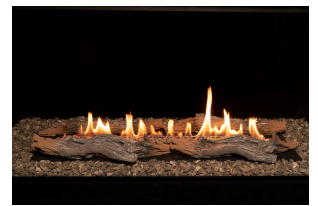
ceramic logs (installed around the burner)